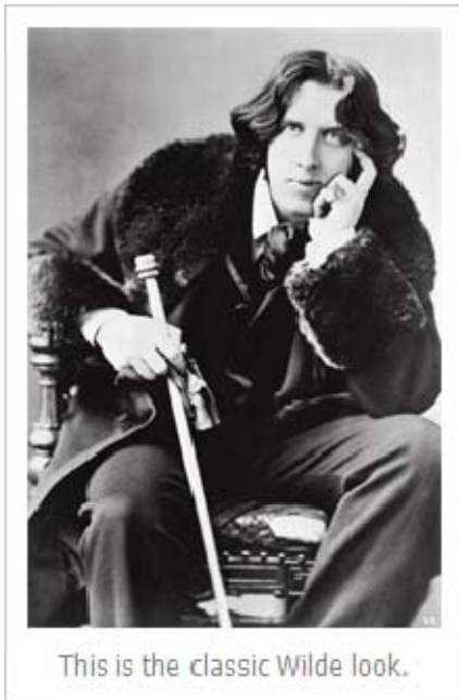
This is the classic Wilde look.